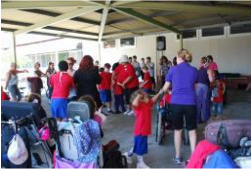
Wesley School Band visit