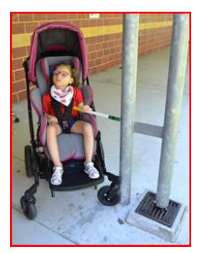
Amalie liked the chimes of the drainpipes.

The students in Red Gum have settled back into school life with smiles on their faces and a little extra mischief that they have acquired over the summer holidays. Red Gum is a very happy place to be.