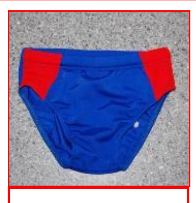
Boys Racers $20.00