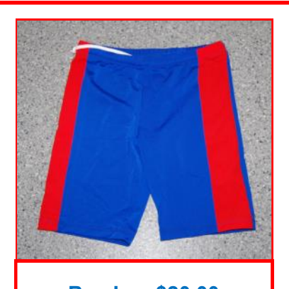
Boy Leg $20.00