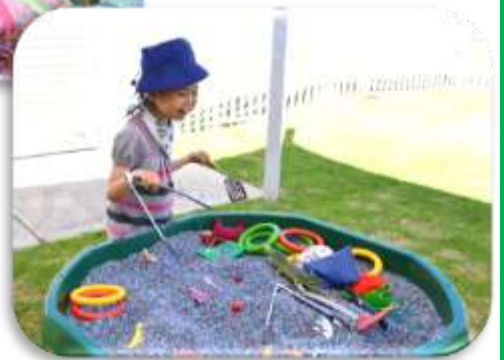
ART – The Rainbow Way (a collaboration by all participants)